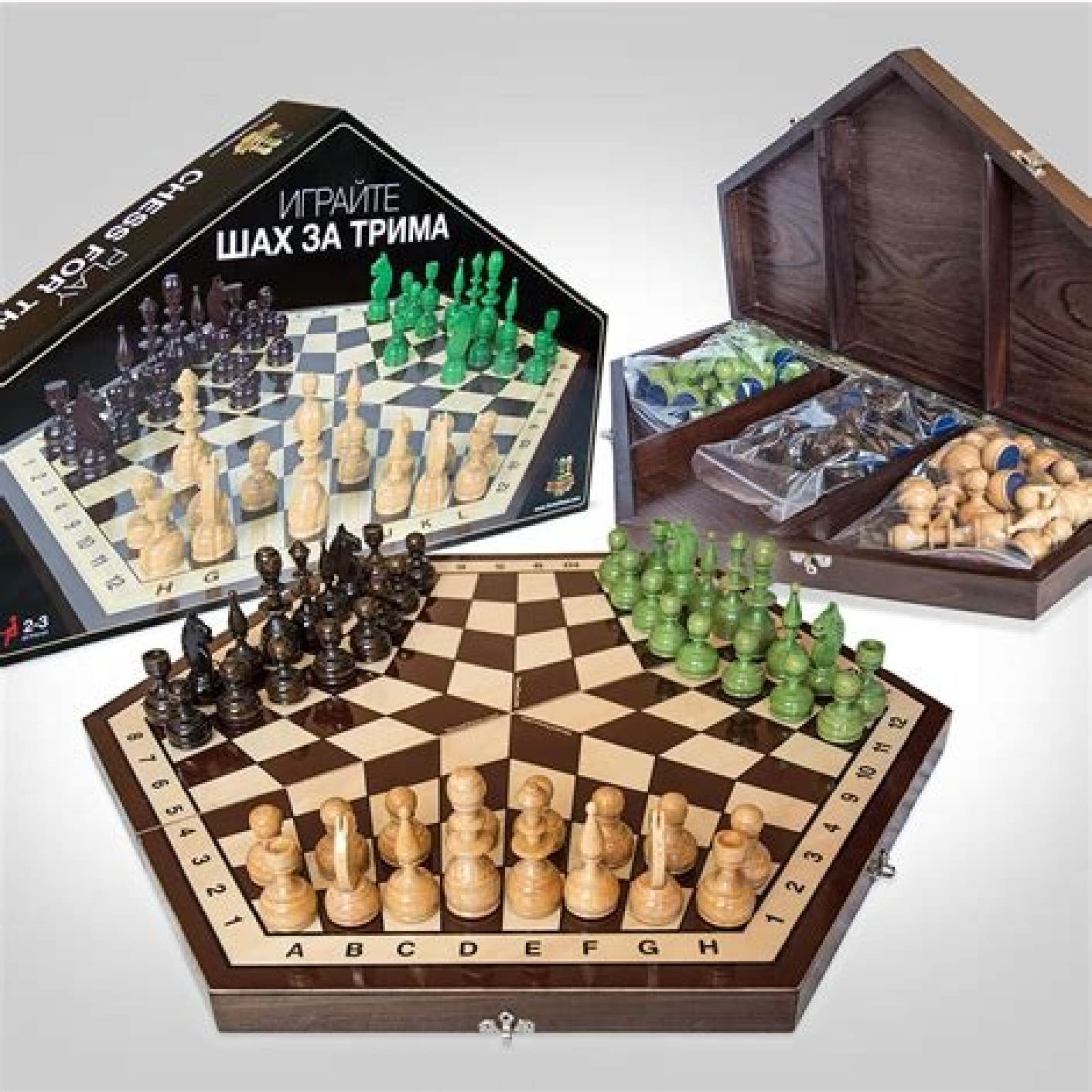
Play 3 player chess online free. Can you win chess in 3 moves. 3 rules of chess. Best online chess players. 3 types of chess. 3 player chess online multiplayer. Top three chess players. 3 player chess online with friends.